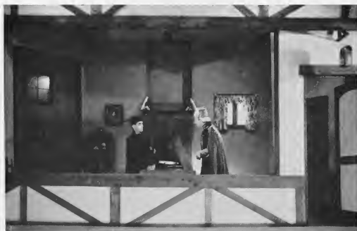
1923-Man Who Married a Dumb Wife-Jan., 1934